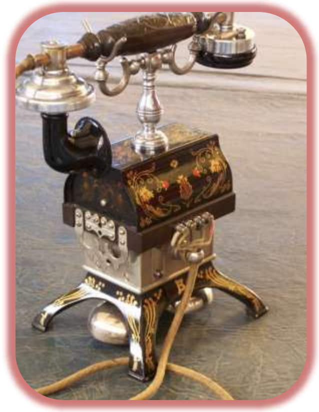
The completely restored telephone, now with a "correct" handset.