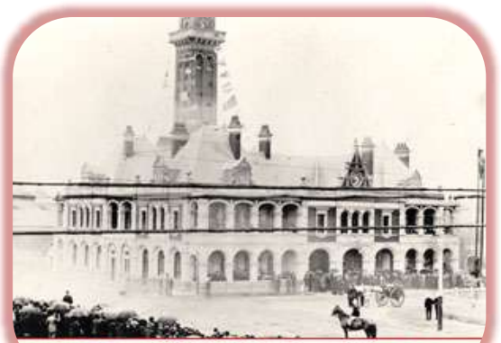
Eastern Hill Fire Station opening, 1893.

When was the pictured building constructed?